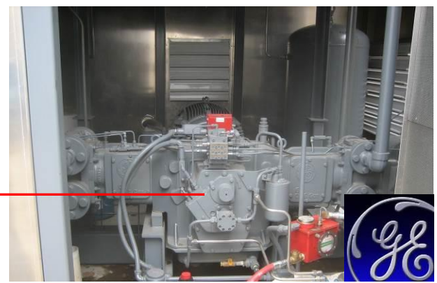
GE Gemini Compressor